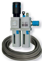
Art. Nr. 24203